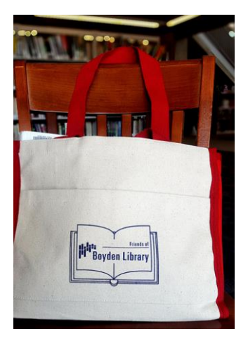
Tote Bags $10 Bags are made of natural cotton canvas and measure 12" x 14.5" x 6.5"

"Reading gives us someplace to go when we have to stay where we are."