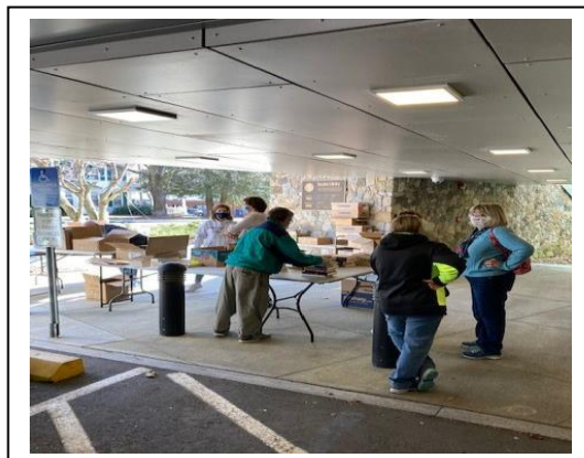
Our "volunteer" Friends collecting books.

Because of the requirements that books be quarantined before they can be lent or in our case sold as part of a book sale we had to come up with a plan to meet library and state guidelines. The Friends presented a plan to the library trustees whereby a drive-by book collection would be held every two weeks in the parking lot. Volunteers from the Friends set up a schedule on-line and by phone limiting the number of people donating books. These patrons were then greeted by our volunteers who retrieved the books from the cars without our patrons having to get out. We collected over 25 boxes of boxes each collection day. The Friends then sorted the books and put them into a quarantined area in the library to await our May book sale. Our patrons were very pleased that they were able to donate their excess books and we were delighted to receive an excellent and quality supply for our upcoming May book sale and to stock our various book shops..